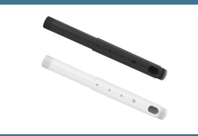
SELECT SUSPENSION ADAPTER