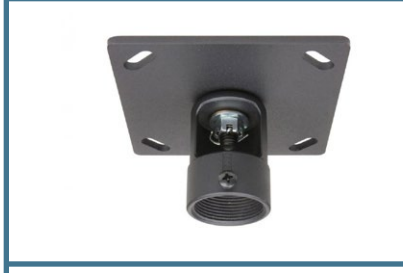
SELECT CEILING SUPPORT