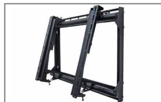
Service kickstand provides 16° of rear display access