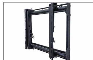
Top-adjustable fine-tune mounting brackets ensure easy display alignment