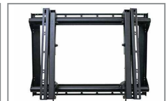
Can be combined with LMV Press & Release™ mount for an affordable video wall