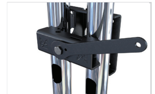
The PSD-HDCA Adapter attaches to stand configurations in under a minute