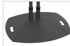
Can be used with a variety of Premier Mounts' Dual-Pole products, including 60", 72", and 84" sets