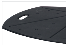
Lightweight base uses ergonomic transport handles