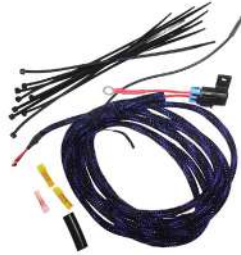
7400-0009 Wiring Kit