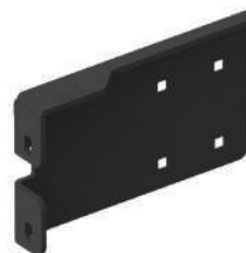
7160-1103 Linde E30 Latch Mounting Bracket