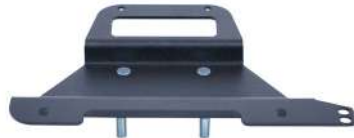
7160-0817 Zebra QLN420 Printer Bracket