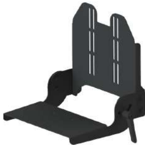
7160-0799 Tablet Keyboard Mount

Configure your keyboard for ultimate ease of use and the fastest possible access with our large selection of Keyboard Mounts. With an ergonomic angle that meets user needs, working on the keyboard in the field can be more streamlined and reliable than ever before.