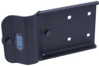
7160-0561 2", 2.5", 3" Diameter Tube Clamp

Expand your mounting location options by connecting your solution to multiple sizes of cylindrical poles, handles, or tubular style overhead guard legs. Adapt a Clam Shell product to finalize the total solution.