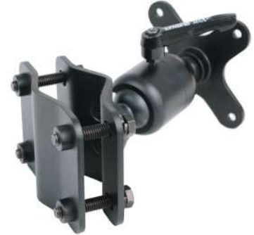
7160-1367-01 Zirkona 3/4" to 1 7/8" Pole Mount with VESA 75mm Mounting Plate