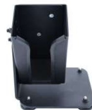
7160-1259 Flat Surface Magnet Mount with Scanner Holder