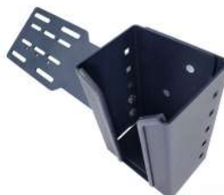
7160-1389 Scanner Pocket Tablet Mount