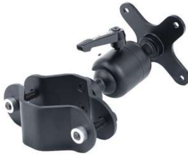
7160-1356-01 Zirkona 2" to 3" Pole Mount with VESA 75mm Mounting Plate