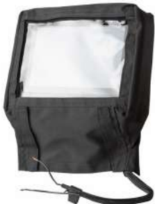
7160-0949 - 8" Protective Cover 7160-0950 - 10" Protective Cover 7160-0981 - 8" Thermal Protective Cover 7160-0982 - 10" Thermal Protective Cover

Encase your device with Gamber-Johnson's patented selection of thermal and non-thermal protective covers. Designed to keep your device safe from the harsh elements in unforgiving work environments that could prematurely destroy your assets.