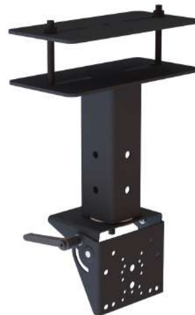
7160-0368 Overhead Guard Mount with Single Clam Shell