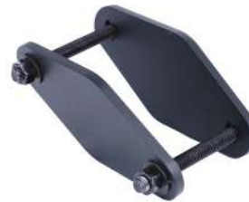
7160-1333 Power Supply Clamp