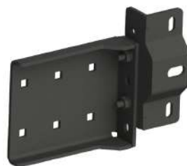
7160-1151 Toyota Cab Latch Mount for Electronic Hydraulics

Secure your valuable tablets and devices right in the cab of your material handling vehicle using one of our reliable OEM specific mounts. Perfectly suited to tailor your workspace to the most efficient, ergonomic, and secure configuration, all while protecting your valuable assets and lift vehicle operators.