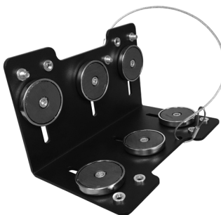
7160-0850 TYRI Redline Light Mount