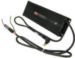
LIND Isolated Power Supply *See website for full assortment

Protect and power your valuable devices by pairing them with a clean, stable power source to guarantee functionality and longevity. Combine with a Gamber-Johnson Wiring Kit and Power Supply Mount for a professional look and quick installation.