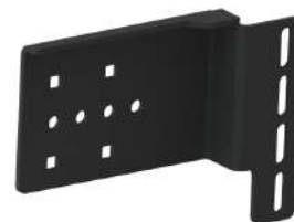
7160-1233 Toyota Cab Mount