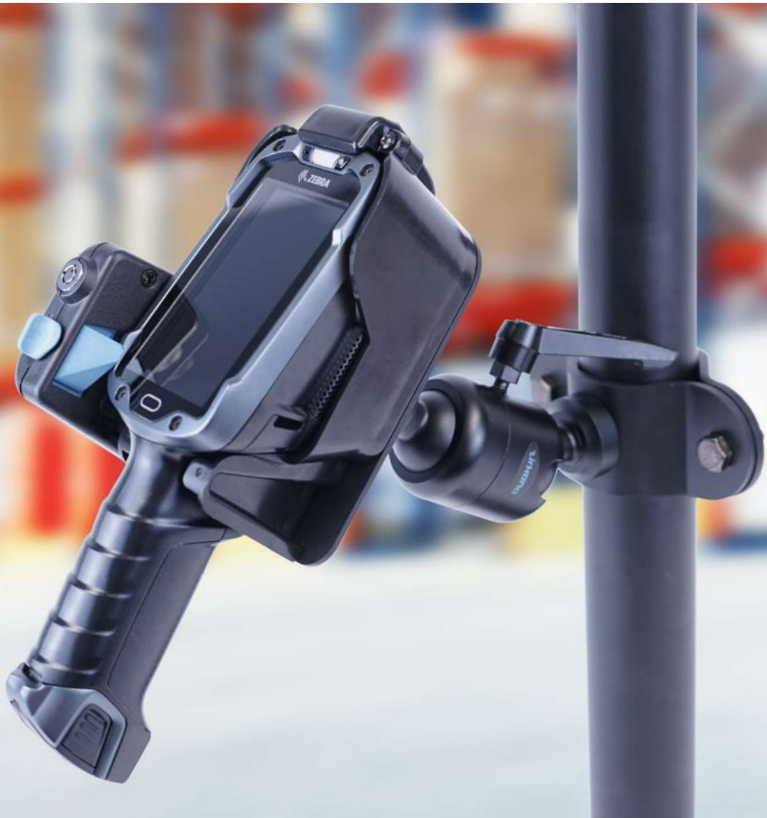
7160-1367 Zirkona 3/4" to 1-7/8" Pole Mount with AMPS/NEC Mounting Plate