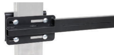
7160-0363 Horizontal Extension Bar

Increase your usable mounting space with our horizontal extension giving you more room to mount a total solution. Compatible with all Gamber-Johnson's roll formed and tube clamp brackets to ensure secure fitment to any overhead guard leg profile.