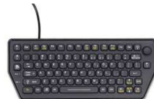
iKey Rugged Keyboard *See website for full assortment