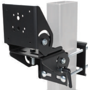
7160-0366 Dual Clam Shell with Small Backer Plate