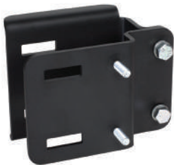
7160-0418 For Yale/Hyster, Crown, Clark and others

We have the ideal products for every mounting situation; including lift vehicles that have roll formed overhead guard legs. These brackets conform perfectly to various roll formed profiles ultimately creating a solid foundation to adapt our Clam Shell product line.