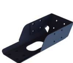
7160-1380 Pistol Grip Scanner Bracket 7170-0774 Zirkona, Pistol Grip Scanner Mount

Safeguard handheld scanners from accidental drops and catastrophic damage by housing your device with the right mount to fit your operation's needs.