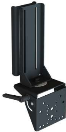
7160-1156-01 Tall Overhead Bar Mount