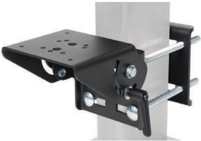
7160-0357 Clam Shell with Small Backer Plate

Our Clam Shell line is Gamber-Johnson's staple product when it comes to extending the usability of technology into the mobile world of material handling. Easily attach any device, dock, cradle, or interface plate with the multiple hole patterns featured on the product. Our Clam Shells work to tailor to individual operator comfort and safety by providing a wide range of adjustments for optimal viewing of a device, improved visibility, and proximity to the operator.