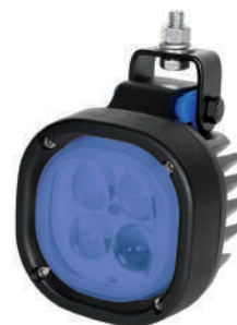
TYRI Safety Lights *See website for full assortment