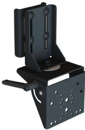
7160-1156 Short Overhead Bar Mount

Increase your operator's forward visibility by tucking your device up and out of the way. Directly mount from the overhead guard using various ergonomic options that best fit a wide variety of operator needs and preferences.