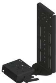
7160-0984 Low Profile Tablet Keyboard Bracket