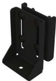
7160-0610 Single Light Bracket

Mount safety lights to present a visual alert to help increase warehouse safety, minimize the risk of accidents, and improve visible awareness of approaching lift vehicles.