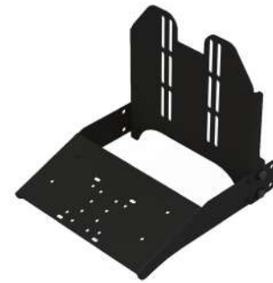
7160-1157 Fixed Tablet Keyboard Mount