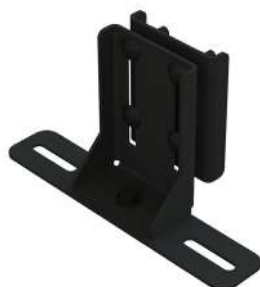
7160-0611 Dual Light Bracket