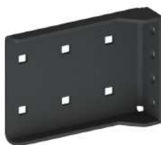
7160-1096 Clamp Bracket Adapter