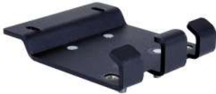
7160-1053 Zebra ZQ520 Printer Mount

Continue to expand from a desk to a mobile work environment by creating a secure and accessible way to mount rugged mobile printers.