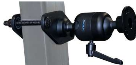
7160-1261 Zirkona 4" Diamond Plate with Large Joiner and AMPS/NEC Plate

When it comes to mounting lightweight devices turn to Gamber-Johnson's diamond plate mounts for a reliable solution. Multiple product offerings to interface your device with various hole patterns and ample adjustability to accommodate operator comfort and ease of use.