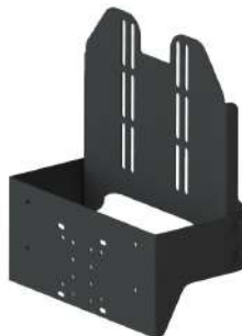
7160-1257 Vertical Tablet Keyboard Mount