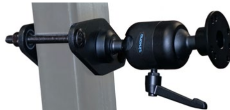
7160-1261 Zirkona 4" Diamond Plate with Large Joiner and AMPS/NEC Plate

When it comes to mounting lightweight devices turn to Gamber-Johnson's diamond plate mounts for a reliable solution. Multiple product offerings to interface your device with various hole patterns and ample adjustability to accommodate operator comfort and ease of use.