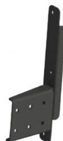
7160-1109 Yale/Hyster Electric Bracket