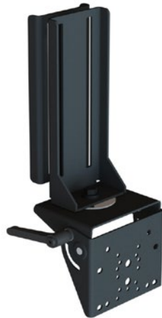
7160-1156-01 Tall Overhead Bar Mount