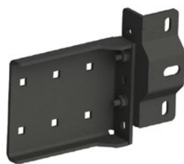
7160-1151 Toyota Cab Latch Mount for Electronic Hydraulics

Secure your valuable tablets and devices right in the cab of your material handling vehicle using one of our reliable OEM specific mounts. Perfectly suited to tailor your workspace to the most efficient, ergonomic, and secure configuration, all while protecting your valuable assets and lift vehicle operators.