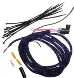
7400-0009 Wiring Kit