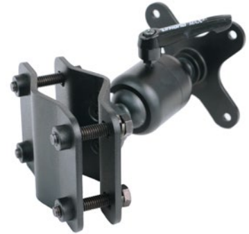
7160-1367-01 Zirkona 3/4" to 1 7/8" Pole Mount with VESA 75mm Mounting Plate