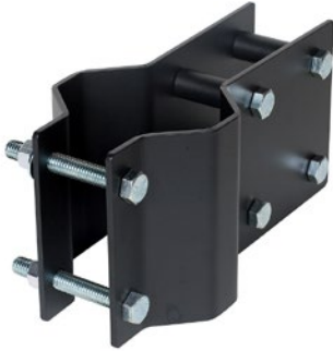
7160-0561 2", 2.5", 3" Diameter Tube Clamp

Expand your mounting location options by connecting your solution to multiple sizes of cylindrical poles, handles, or tubular style overhead guard legs. Adapt a Clam Shell product to finalize the total solution.