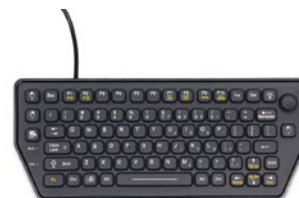
iKey Rugged Keyboard *See website for full assortment