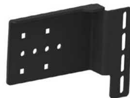
7160-1233 Toyota Cab Mount