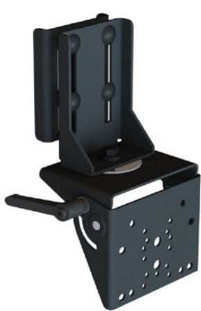
7160-1156 Short Overhead Bar Mount

Increase your operator's forward visibility by tucking your device up and out of the way. Directly mount from the overhead guard using various ergonomic options that best fit a wide variety of operator needs and preferences.