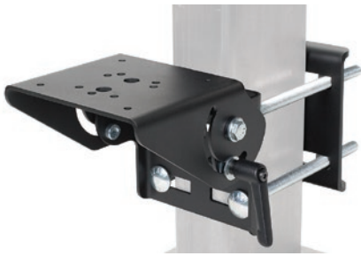
7160-0357 Clam Shell with Small Backer Plate

Our Clam Shell line is Gamber-Johnson's staple product when it comes to extending the usability of technology into the mobile world of material handling. Easily attach any device, dock, cradle, or interface plate with the multiple hole patterns featured on the product. Our Clam Shells work to tailor to individual operator comfort and safety by providing a wide range of adjustments for optimal viewing of a device, improved visibility, and proximity to the operator.