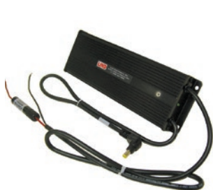
LIND Isolated Power Supply *See website for full assortment

Protect and power your valuable devices by pairing them with a clean, stable power source to guarantee functionality and longevity. Combine with a Gamber-Johnson Wiring Kit and Power Supply Mount for a professional look and quick installation.