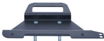
7160-0817 Zebra QLN420 Printer Bracket