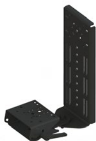
7160-0984 Low Profile Tablet Keyboard Bracket