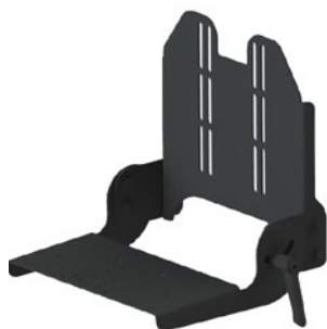
7160-0799 Tablet Keyboard Mount

Configure your keyboard for ultimate ease of use and the fastest possible access with our large selection of Keyboard Mounts. With an ergonomic angle that meets user needs, working on the keyboard in the field can be more streamlined and reliable than ever before.