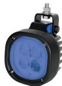
TYRI Safety Lights *See website for full assortment