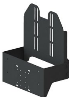
7160-1257 Vertical Tablet Keyboard Mount