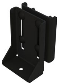
7160-0610 Single Light Bracket

Mount safety lights to present a visual alert to help increase warehouse safety, minimize the risk of accidents, and improve visible awareness of approaching lift vehicles.