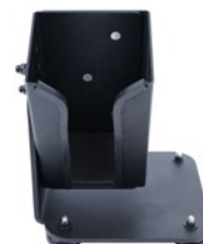
7160-1259 Flat Surface Magnet Mount with Scanner Holder