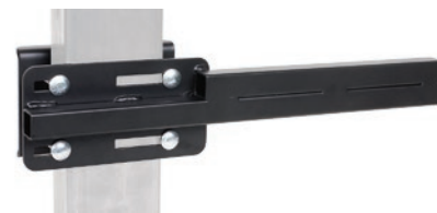
7160-0363 Horizontal Extension Bar

Increase your usable mounting space with our horizontal extension giving you more room to mount a total solution. Compatible with all Gamber-Johnson's roll formed and tube clamp brackets to ensure secure fitment to any overhead guard leg profile.