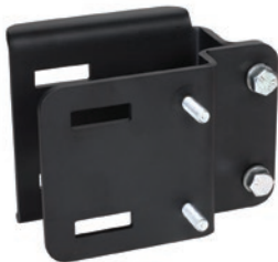
7160-0418 For Yale/Hyster, Crown, Clark and others

We have the ideal products for every mounting situation; including lift vehicles that have roll formed overhead guard legs. These brackets conform perfectly to various roll formed profiles ultimately creating a solid foundation to adapt our Clam Shell product line.