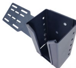
7160-1389 Scanner Pocket Tablet Mount