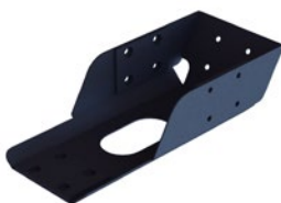
7160-1380 Pistol Grip Scanner Bracket 7170-0774 Zirkona, Pistol Grip Scanner Mount

Safeguard handheld scanners from accidental drops and catastrophic damage by housing your device with the right mount to fit your operation's needs.