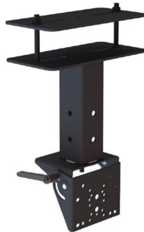
7160-0368 Overhead Guard Mount with Single Clam Shell