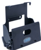
7160-0888 Datamax O'Neil RL4 Printer Bracket

Continue to expand from a desk to a mobile work environment by creating a secure and accessible way to mount rugged mobile printers.