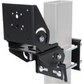
7160-0366 Dual Clam Shell with Small Backer Plate