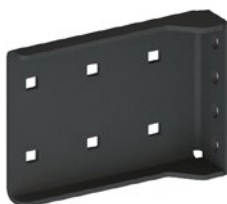
7160-1096 Clamp Bracket Adapter