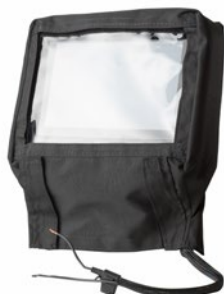
7160-0949 - 8" Protective Cover 7160-0950 - 10" Protective Cover 7160-0981 - 8" Thermal Protective Cover 7160-0982 - 10" Thermal Protective Cover

Encase your device with Gamber-Johnson's patented selection of thermal and non-thermal protective covers. Designed to keep your device safe from the harsh elements in unforgiving work environments that could prematurely destroy your assets.