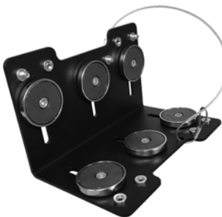
7160-0850 TYRI Redline Light Mount