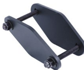
7160-1333 Power Supply Clamp