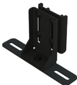
7160-0611 Dual Light Bracket