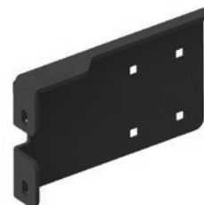
7160-1103 Linde E30 Latch Mounting Bracket