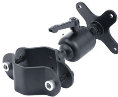
7160-1356-01 Zirkona 2" to 3" Pole Mount with VESA 75mm Mounting Plate