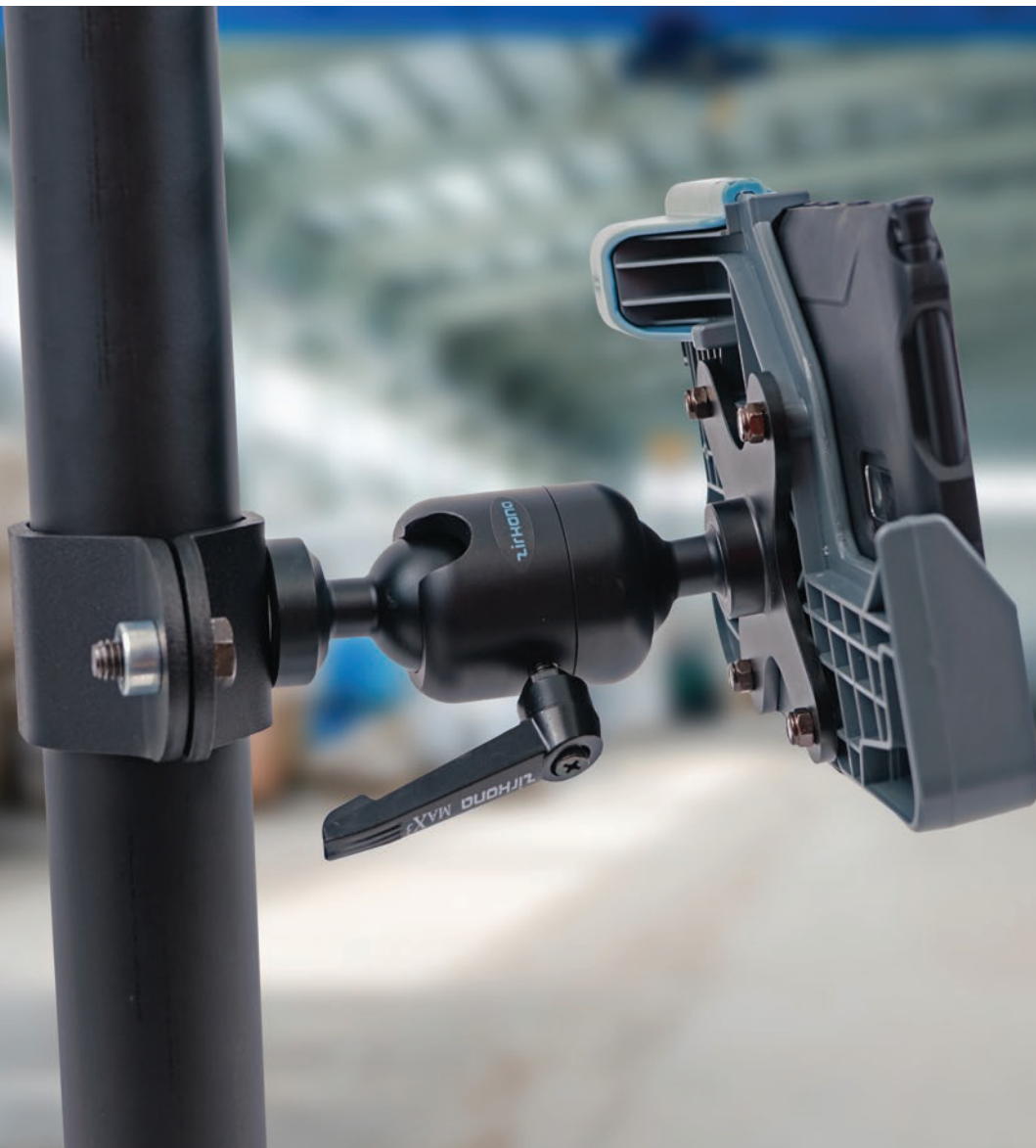
7160-1367 Zirkona 3/4" to 1-7/8" Pole Mount with AMPS/NEC Mounting Plate