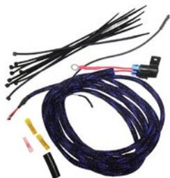
7400-0009 Wiring Kit