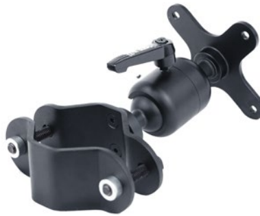
7160-1356-01 Zirkona 2" to 3" Pole Mount with VESA 75mm Mounting Plate