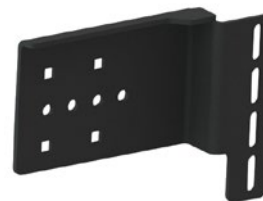
7160-1233 Toyota Cab Mount