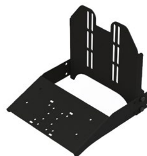
7160-1157 Fixed Tablet Keyboard Mount