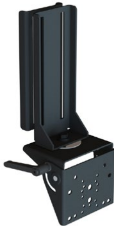
7160-1156-01 Tall Overhead Bar Mount