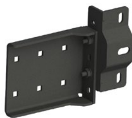
7160-1151 Toyota Cab Latch Mount for Electronic Hydraulics

Secure your valuable tablets and devices right in the cab of your material handling vehicle using one of our reliable OEM specific mounts. Perfectly suited to tailor your workspace to the most efficient, ergonomic, and secure configuration, all while protecting your valuable assets and lift vehicle operators.