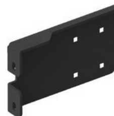
7160-1103 Linde E30 Latch Mounting Bracket