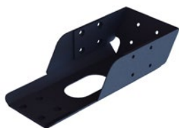
7160-1380 Pistol Grip Scanner Bracket 7170-0774 Zirkona, Pistol Grip Scanner Mount

Safeguard handheld scanners from accidental drops and catastrophic damage by housing your device with the right mount to fit your operation's needs.