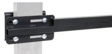
7160-0363 Horizontal Extension Bar

Increase your usable mounting space with our horizontal extension giving you more room to mount a total solution. Compatible with all Gamber-Johnson's roll formed and tube clamp brackets to ensure secure fitment to any overhead guard leg profile.