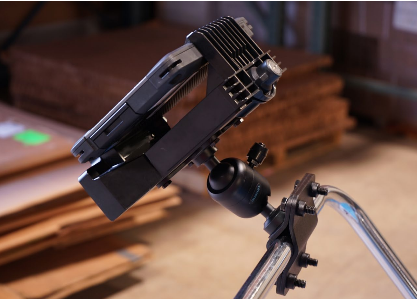
7160-1367 Zirkona 3/4" to 1-7/8" Pole Mount with AMPS/NEC Mounting Plate