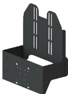
7160-1257 Vertical Tablet Keyboard Mount