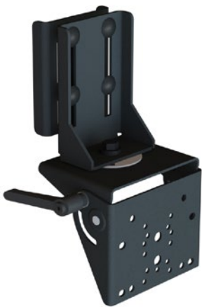
7160-1156 Short Overhead Bar Mount

Increase your operator's forward visibility by tucking your device up and out of the way. Directly mount from the overhead guard using various ergonomic options that best fit a wide variety of operator needs and preferences.