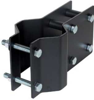
7160-0561 2", 2.5", 3" Diameter Tube Clamp

Expand your mounting location options by connecting your solution to multiple sizes of cylindrical poles, handles, or tubular style overhead guard legs. Adapt a Clam Shell product to finalize the total solution.