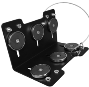
7160-0850 TYRI Redline Light Mount