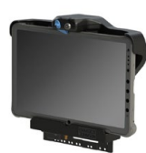
7160-0987-00 F110 Docking Station