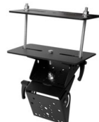
7160-0586 Short Overhead Guard Mount with Dual Clam Shell