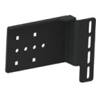
7160-1233 Toyota Cab Mount