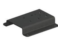
7160-1105 Flat Surface Mount