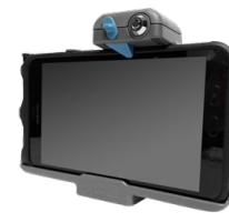
7160-1029-00 Samsung Galaxy Tab Active2 Docking Station