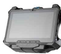
7160-0840-00 Latitude 12 Rugged Tablet Docking Station