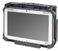
7160-0487-00 FZ-G1 Tablet Docking Station