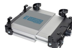
7160-0402-03 NotePad V-LT Universal Computer Cradle