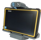
7160-1135-01 ZX70 Powered Cradle