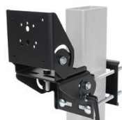
7160-0366 Dual Clam Shell with Small Backer Plate *Also available with large backer plate (7160-0367)