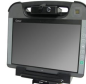
7160-0760-00 RX10 Docking Station