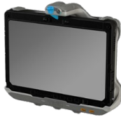
7160-1084-00 K120 Docking Station