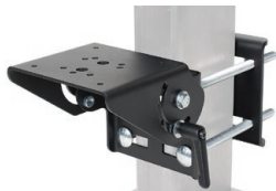
7160-0357 Clam Shell with Small Backer Plate *Also available with large backer plate (7160-0370)