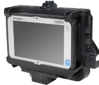
7160-0531-00 FZ-M1 Tablet Docking Station