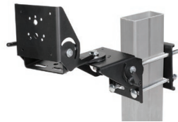
7160-0420 Dual Clam Shell with Arm and Small Backer Plate *Also available with large backer plate (7160-0421)