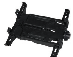
7160-0774 TabCruzer Mini Universal Cradle For 7-10" Tablets