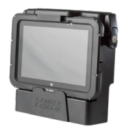
7160-0861-00 ET50/55 8" Rugged Frame Docking Station *Also available in a 10" (7160-0860-00)