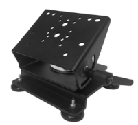
7160-1258 Magnetic Surface Mount