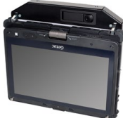
7160-0515-00 V110 Docking Station