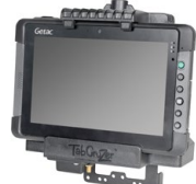
7160-0565-00 T800 Docking Station