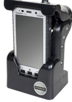
7160-0564 FZ-X1 Powered Cradle