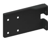
7160-1103 Linde E30 Latch Mounting Bracket