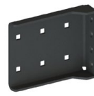
7160-1096 Clamp Bracket Adapter