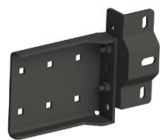
7160-1151 Toyota Cab Latch Mount for Electronic Hydraulics