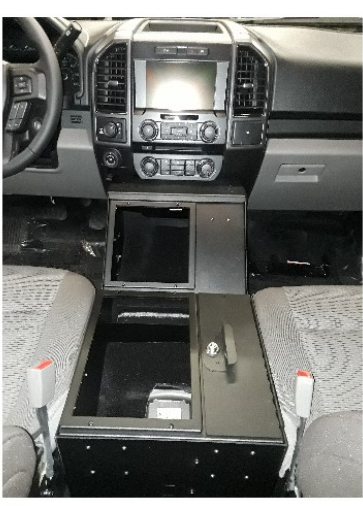
Step 7 Interior Parts Resintalled