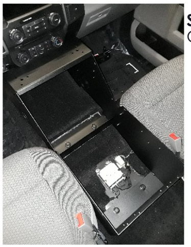
Step 6 Console Installed

7. Reinstall the interior pocket, horizontal and angled panel sections that were removed previously. Note the orientation of the angle panel section for models with floor 4x4 shifters. The radio opening on the panel is placed on the passenger side to avoid the 4x4 shifter panel on the driver side.