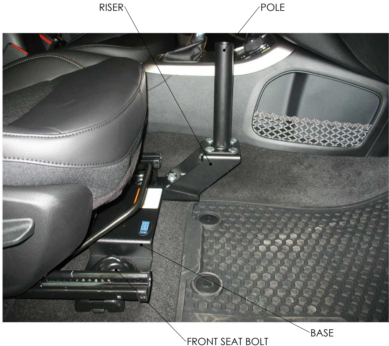
Base Installed With DS-LOWER-9 Pole