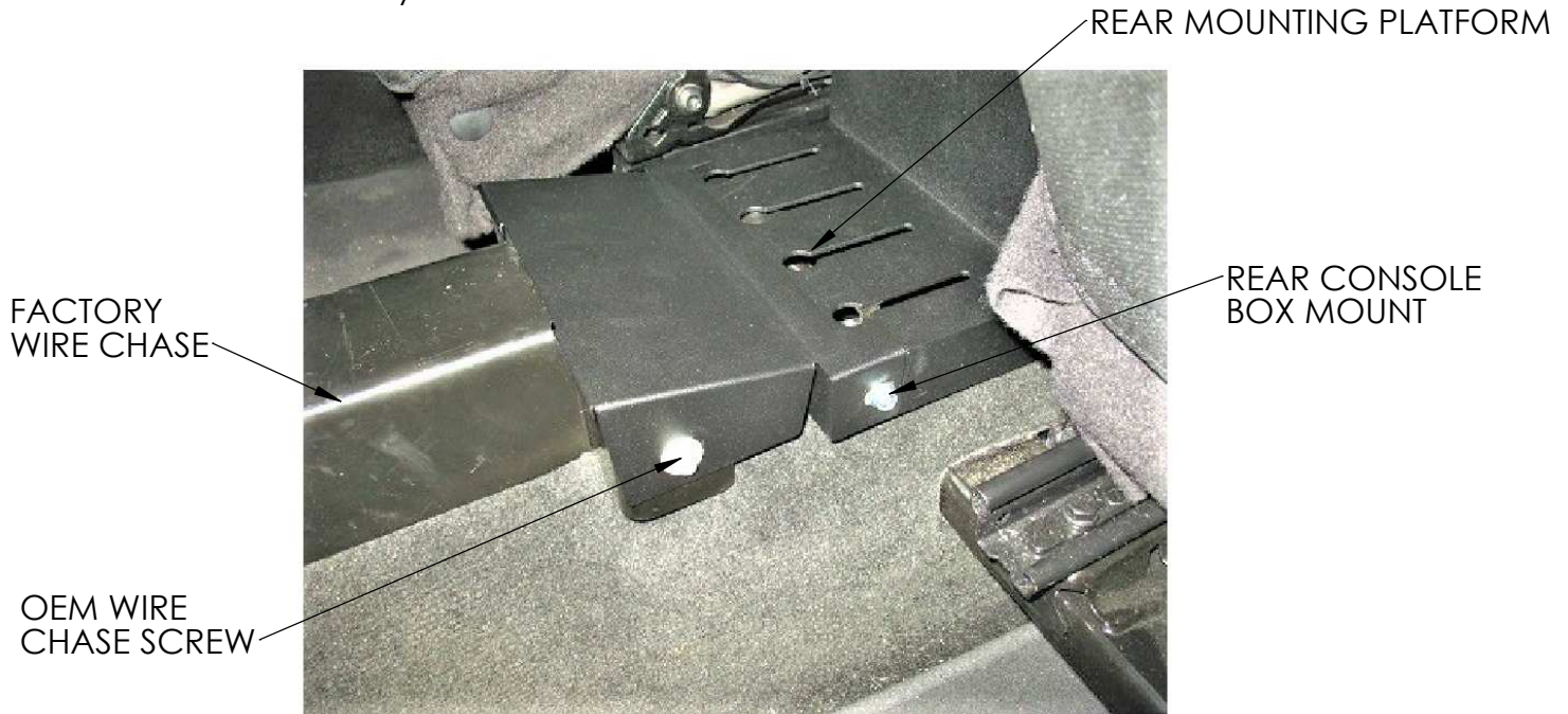
FIG 4 - Rear Wire Chase Cover

NOTE: Some downward pressure on the cover may be required to align the holes in both the console box and factory wire chase.