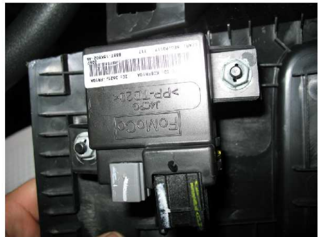
FIG 2 - OEM Module Attached to Trim

NOTE: If a cup holder is being installed into the horizontal equipment area, it may be easier to install this into the box first outside the vehicle. Otherwise the side hold down screws can be difficult to reach once installed because of the seats.