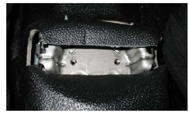
Fig 1 - Rear Mounting Bracket, Carpet Cut to Revel Threaded Inserts