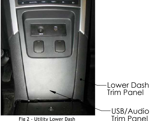
Fig 2 - Utility Lower Dash