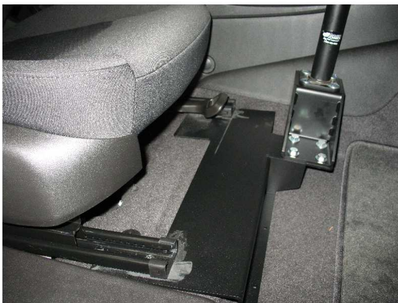
FIG 4 - Offset riser installed on base