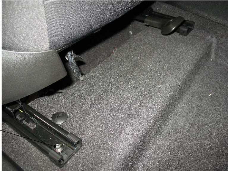
FIG 1 - Front Seat Bolts (T-50 Bit Required)