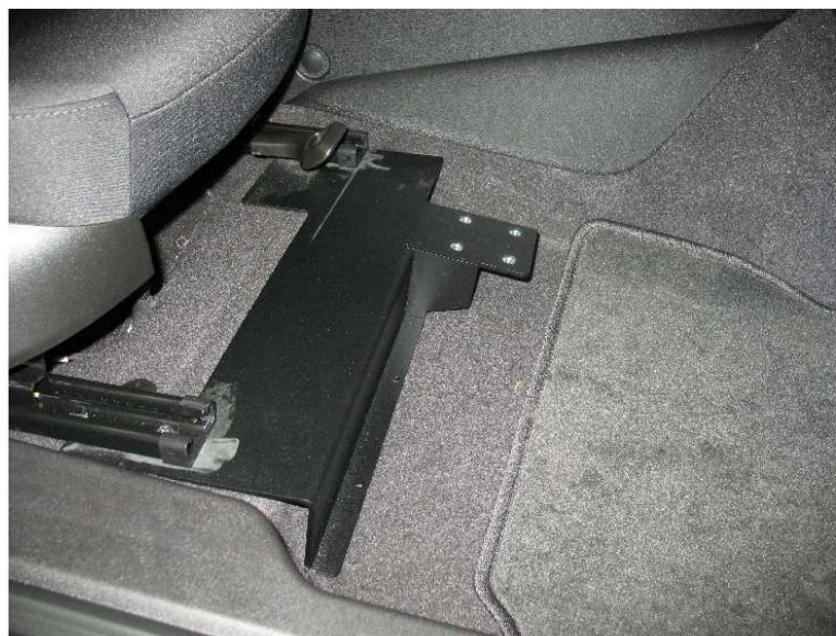
FIG 2 - Base installed between seat rail and floor