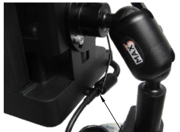
Figure: 12 —Wire Tie

Bend cable around to that it can be attached to the dock using a wire tie. Once secured to the dock excess wire material can be cut off for cleaner look. See Figure: 12