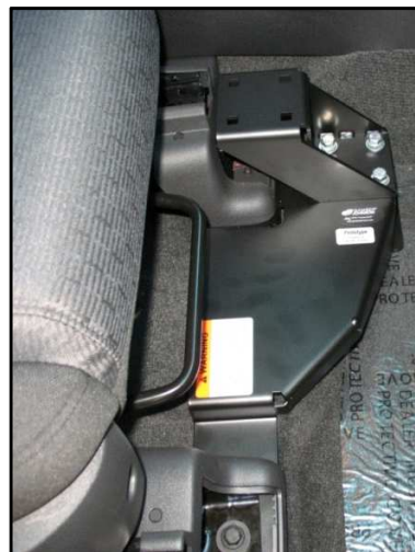
Figure 3 - Add DS-Step to top of base for completed assembly.