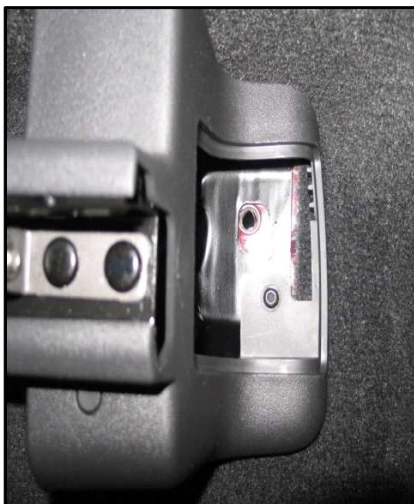
Figure 1-Remove trim cap from passenger side seat.