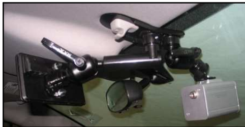
Figure 1. Secure Visor Mount with passenger side visor retainer.